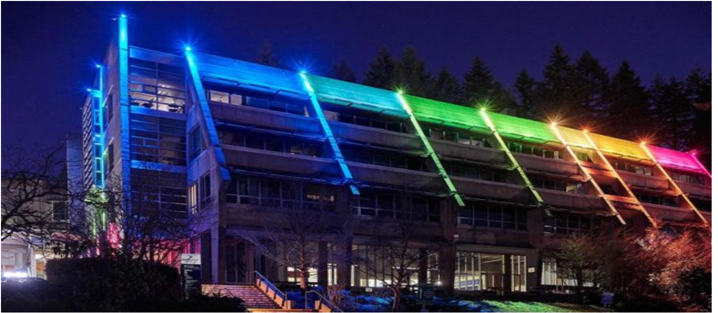
CAPILANO UNIVERSITY | THE LUMINOUS PROJECT

© Integral Group 2022 | All rights reserved Privacy Policy