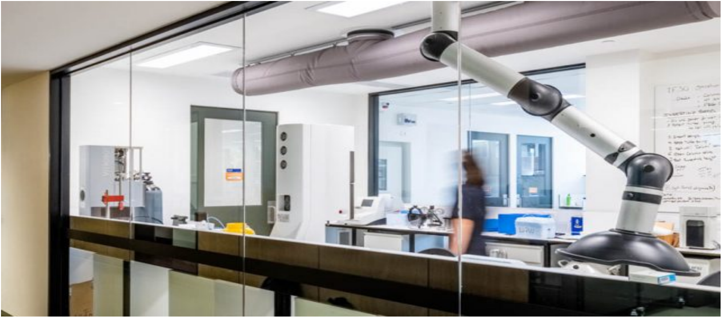
UNIVERSITY OF MELBOURNE | ADVANCED MICROSCOPY FACILITY