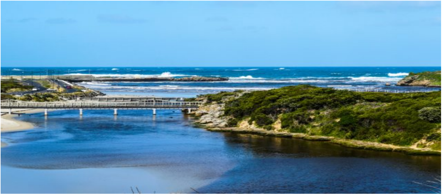
HYCEL TECHNOLOGY HUB | DEAKIN UNIVERSITY