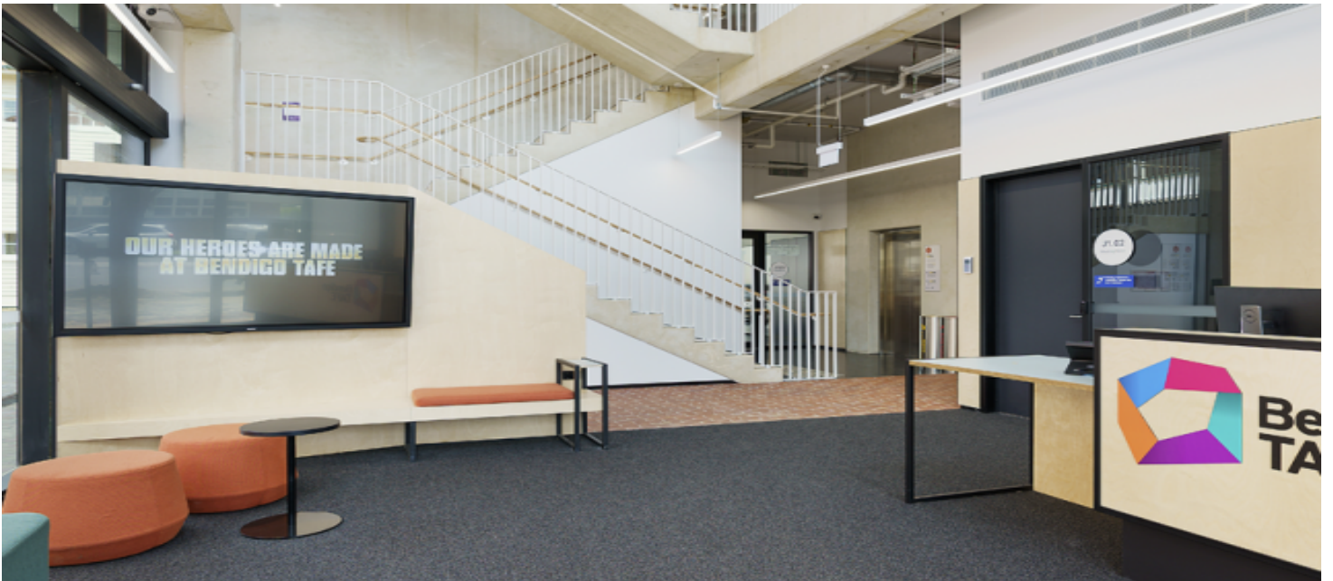
BENDIGO TAFE | BENDIGO KANGAN INSTITUTE